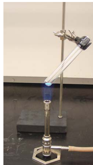
Figure 2. Heating the test tube.