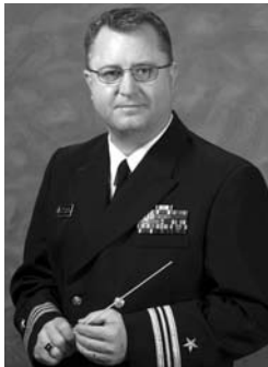
USNA Band Photo