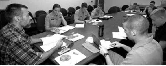
Shannon O'Connor, USNA Photo Lab