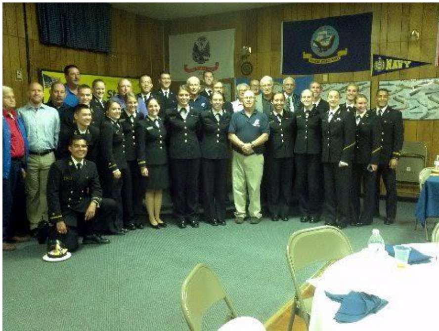
The Midshipmen enjoyed their dinner at the VFW, hearing stories of courage and service from three different generations of Sailors from WWII, Korea, and Vietnam.