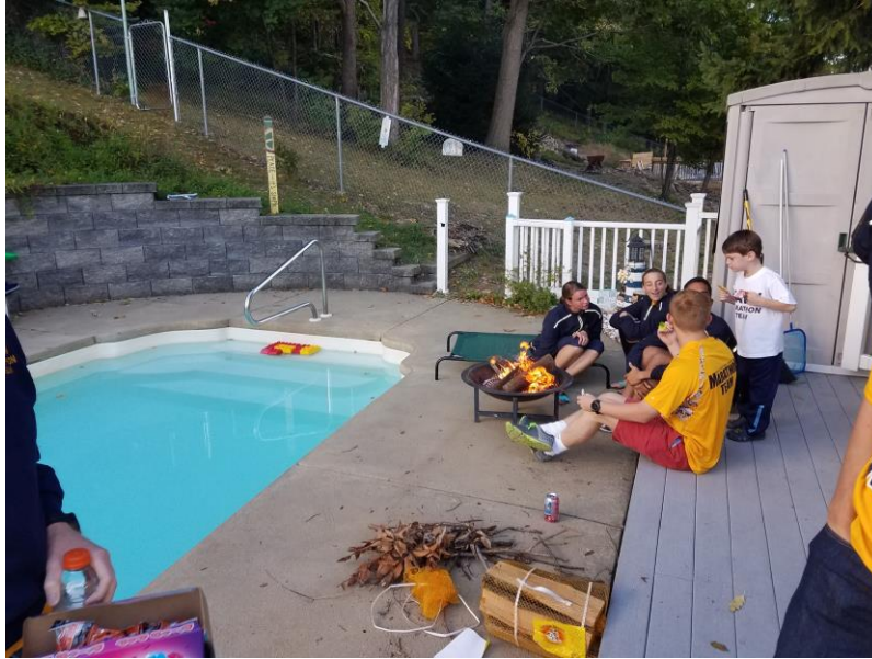
The team enjoys the pool and a bonfire following the race