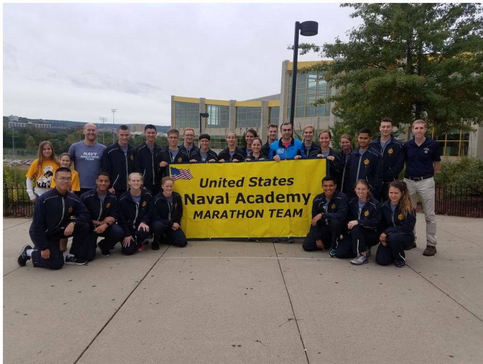
Team picture outside of Scranton High School (packet pickup location)