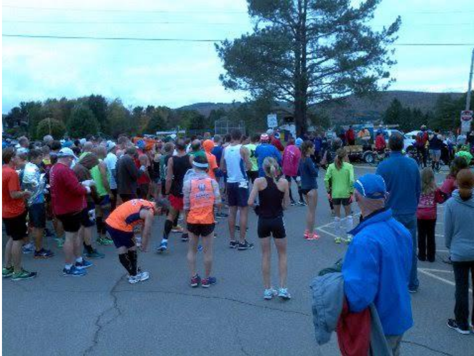
The team prepares prior to the start of the marathon