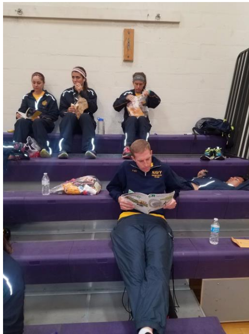
Runners anxiously anticipate the start of the race