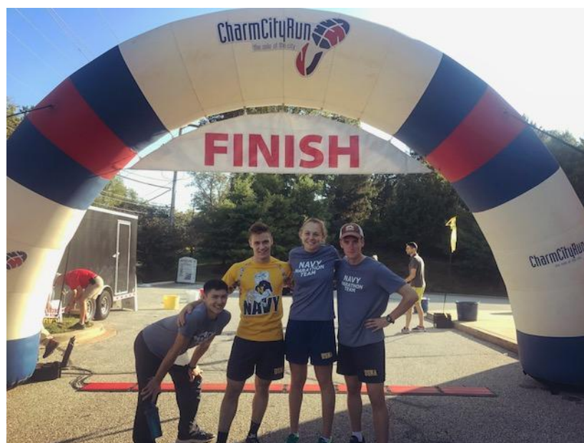
Midshipman volunteers helped runners stay motivated and hydrated!