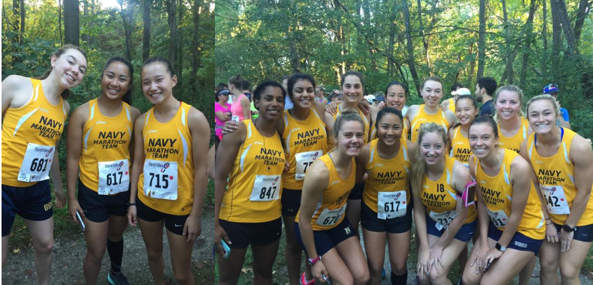
The girls got together for a few pictures at the start line.