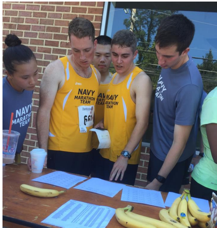
Members of the team grabbing some post-race snacks and checking the results.