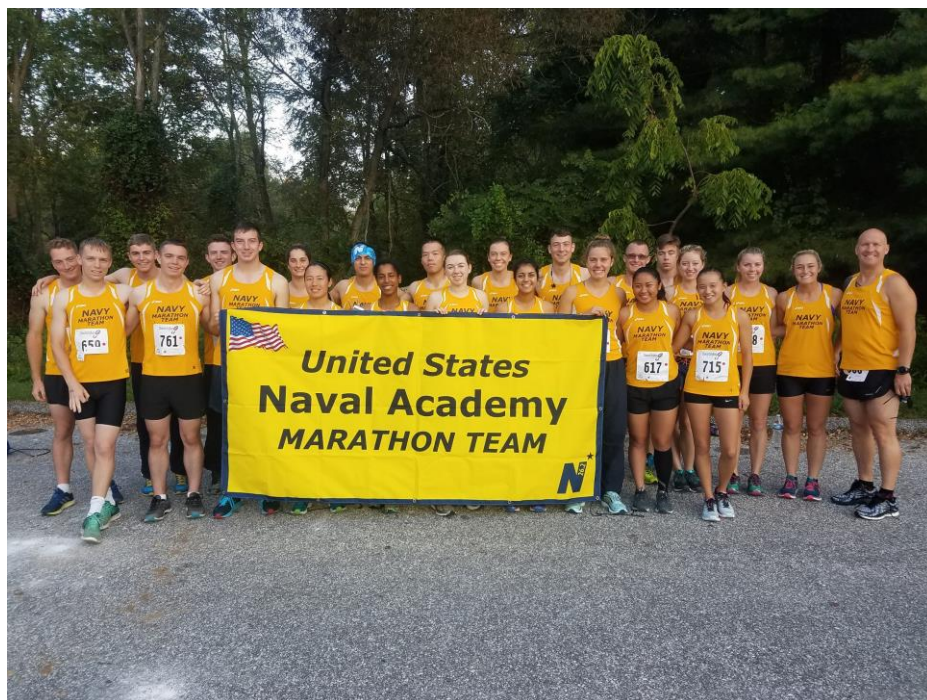
Photo of the Naval Academy Marathon Team before the start of the race.