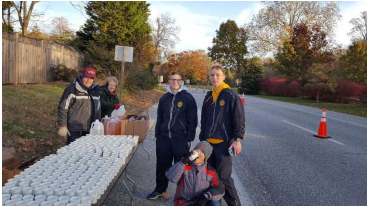
Midshipmen volunteers pose with other Annapolis Classic Volunteers at their water station before the runners pass by.