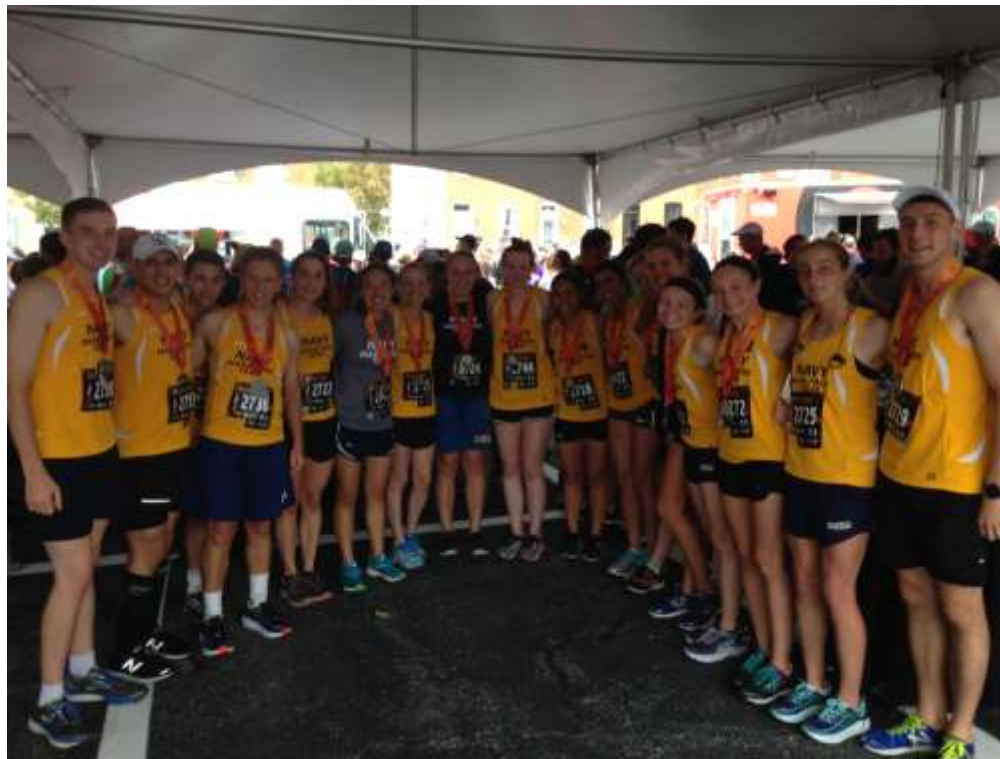
Team Runners Gather for a Photo Post-Race