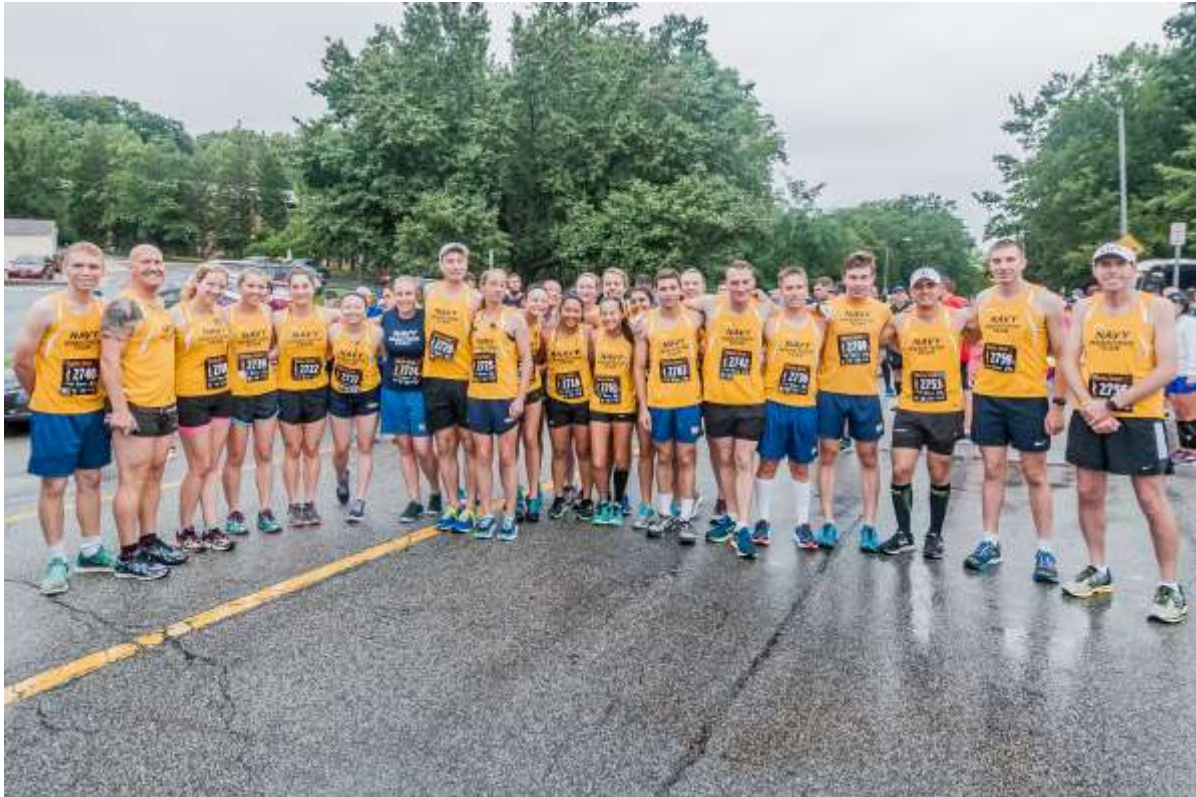
At The Start Line