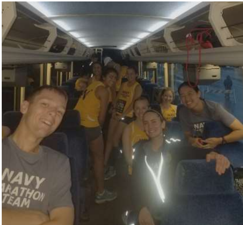
Runners Prepare Their Bibs and Jerseys Before the Race

On 2 September, 2017, the United States Naval Academy Marathon Team traveled from USNA to Baltimore to compete in this incredible event. This race was particularly special for the team, as the participant turnout was very high and allowed for the team to travel together to compete. The 2017 Charles St 12 had over 2000 runners participate. After loading onto the bus at 0500, the team departed USNA and arrived at Towson at 0545 where it conducted packet pick-up. At 0715, the team moved to the start line, taking its place at the front of the pack. The air horn sounded, and within two hours the entire team had finished the grueling twelve mile race.