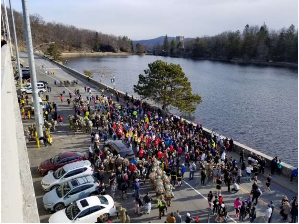
Starting location for the Half Marathon. Lower parking lot outside Michie Stadium.