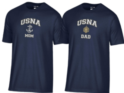
PARENT SHIRTS | $26.00