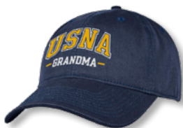
FAMILY HATS | $25.00