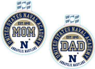
MOM & DAD DECALS | $5.00