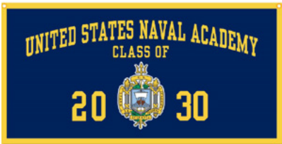
BANNER | $45.00