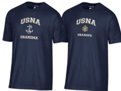
GRANDPARENT SHIRTS | $26.00